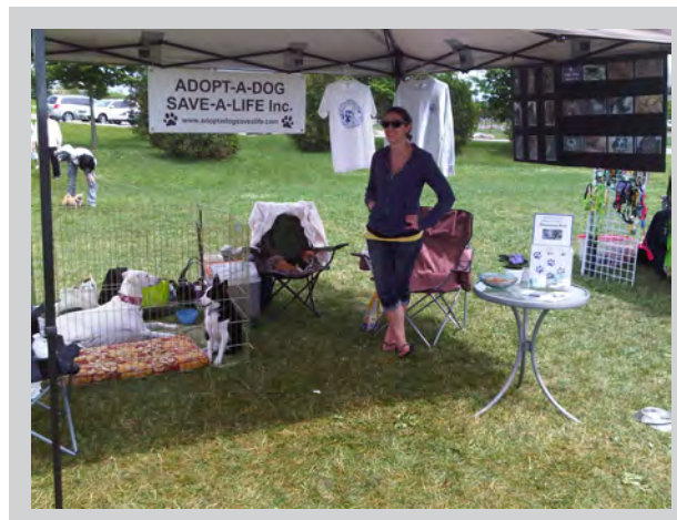
Our fundraising booth at Pooch Party 2011.

"Committed to finding loving homes for abandoned dogs"