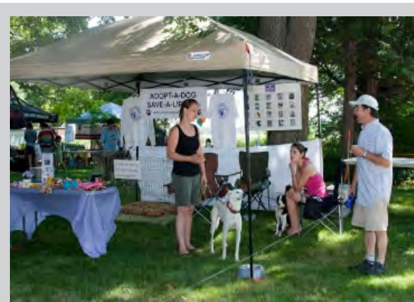
Our fundraising booth at Dog Days of Scugog 2010.