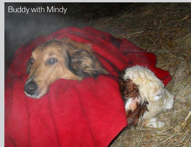
Buddy with Mindy