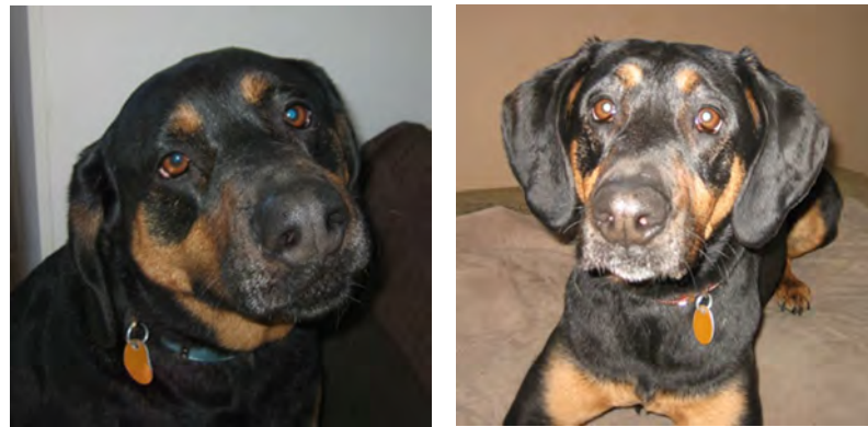
Moe & Harley

These two 7 year-old brothers are wonderful hound mixes who would be so happy to be adopted either together or separately. They are sweet, playful and well socialized with other dogs. Please consider them for a new addition to your family.